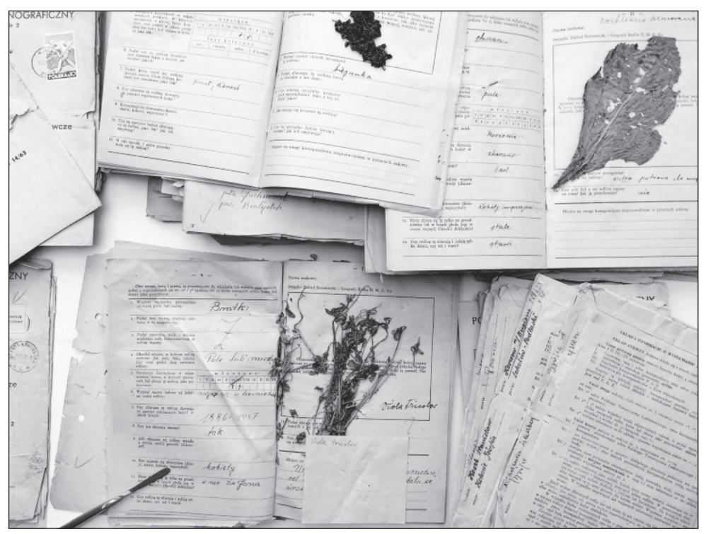
Photograph 2 The preservation state of selected questionnaires before conservation. Wrocław, 15th March 2015.